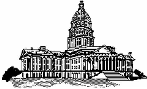
TABLE OF CONTENTS (continued)