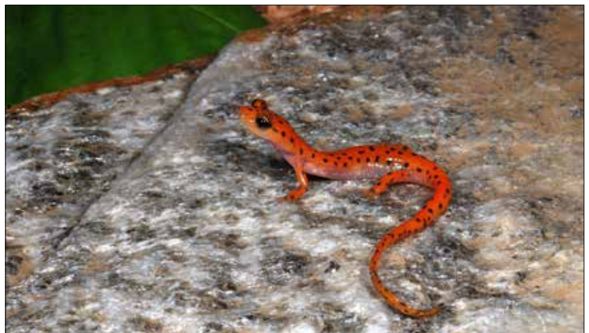
The brightly colored Cave Salamander, Eurycea lucifuga , is known only from the Ozark Plateau in southeastern Cherokee County. True to its name, the Cave Salamander is typically found in the twilight zone of caves with permanent spring flows. This species is listed as Endangered by the state of Kansas and benefits from contributions to the Chickadee Checkoff on your Kansas Income Tax Return.

Contact our Taxpayer Assistance Center (page 28) if you have questions about the Kansas use tax.